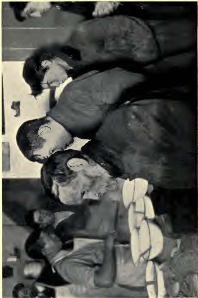
AT ONE OF THE ARMY FOOD DÉPÔTS